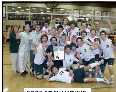
2006 CIF CHAMPIONS

Full refund available only if cancelled before June 27th, 2008. $50 administrative fee will be applied